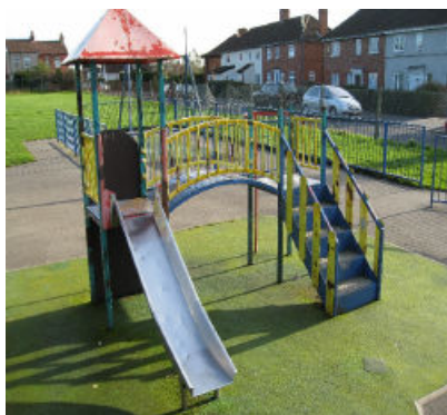
SPRINGFIELD AVENUE BS11