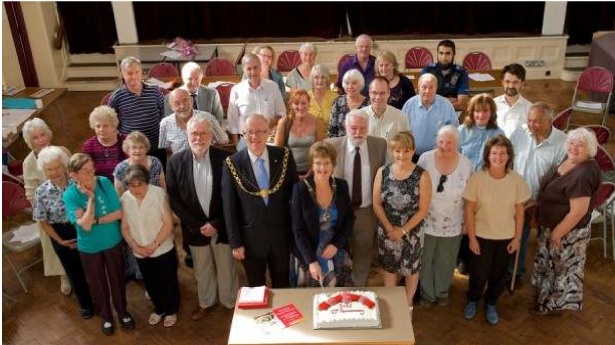
The Lady Mayoress cutting SCAF's 10th Birthday cake.

The Full Forum met 5 times during the year. The main purpose of the Forum is to enable the Action Groups to report on their activities. There is a very fruitful interaction between the various groups in these discussions, and each group benefits from the inputs from members of other groups, and from SCAF members who are not also members of a group